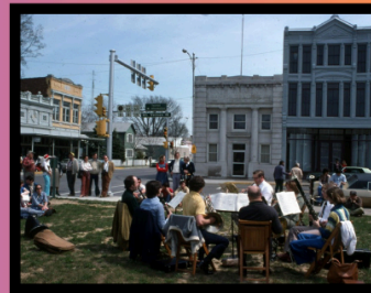
Maclure Square in New Harmony, Indiana, undated