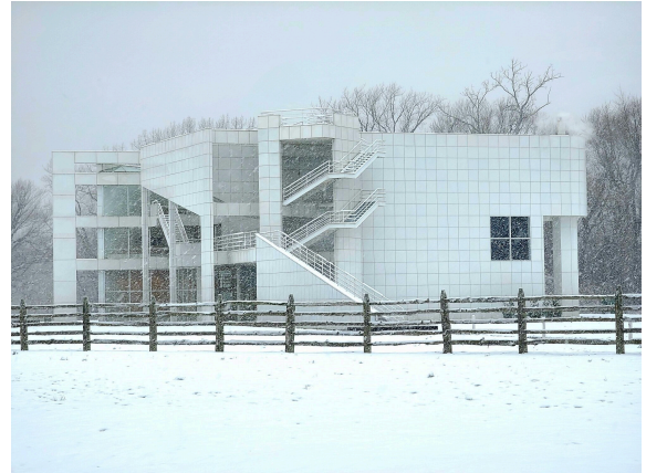
The Atheneum Visitors Center in the winter.