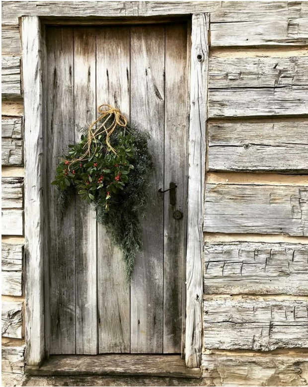
Christmas swag hanging on the door of the Eigner Cabin in New Harmony, Indiana, in December 2023.

Harmony Inn, one in the park as well / It's the sturdy kind that doesn't mind the snow..." New Harmony is at its best this time of year, especially as the New Harmony community bands together to offer Christmas in New Harmony during the first weekend of December. There's something for everyone to enjoy with a Christmas tree lighting, holiday parades, Candyland, caroling, food, local shopping, and more!