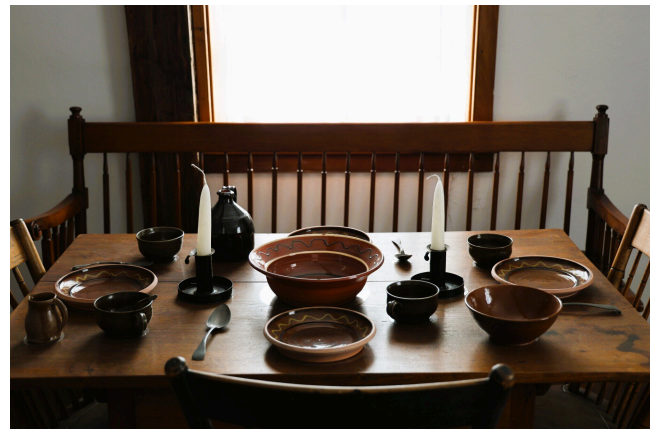
Table scene at the David Lenz House.

Tickets: $20 (available at Community House No. 2, located at 410 Main Street)