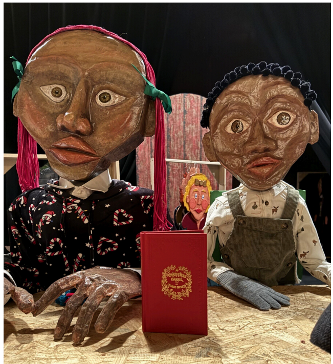
Puppets from A Christmas Carol .

A public reception for Filled Up 5: A Ceramic Cup Show will be held from 4 to 6 p.m. Saturday, December 7 in conjunction with the Christmas in