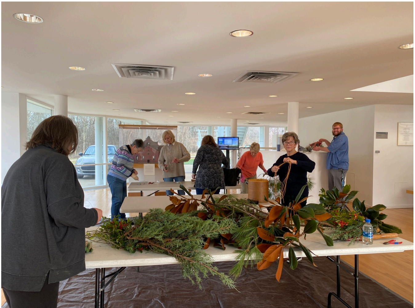
Volunteers make Christmas swag to decorate doors of historic sites in New Harmony in 2022.