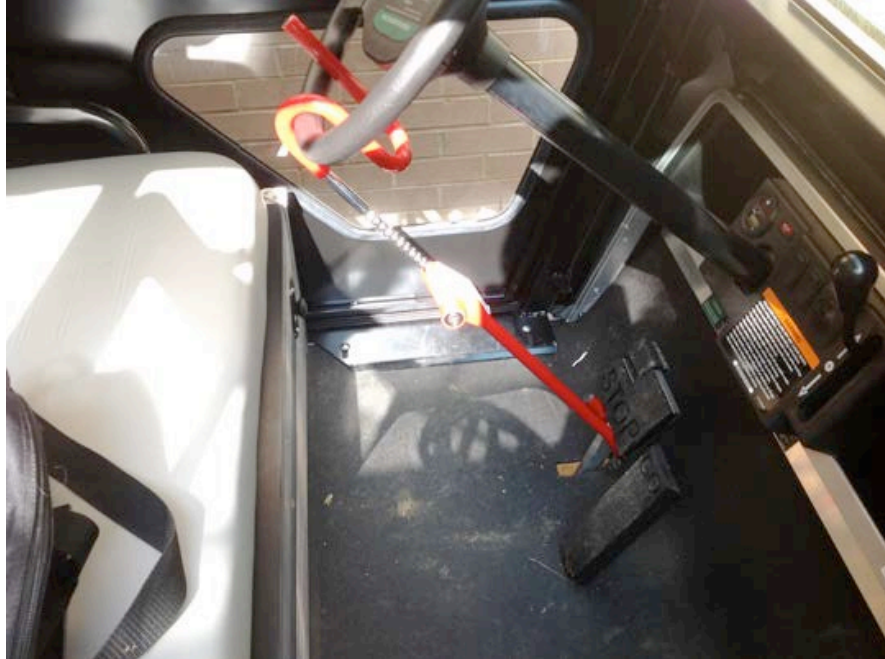
Properly engaged anti-theft brake-steering wheel lock for the golf carts.