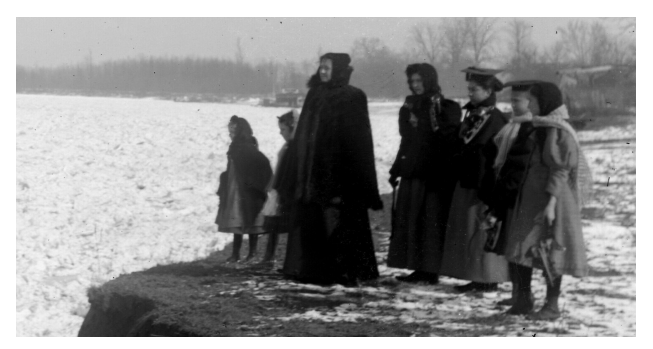
Close-up image of photograph.

what's on our minds this winter. While the Atheneum is closed in January and February, workers are bustling inside to replace the HVAC system to ensure improved climate control in the future. Likewise, the staff at Historic New Harmony use this time to prepare for the upcoming tourist season and plan our signature events throughout the rest of the year. Have no fear, though—there are still activities for you to do in New Harmony!