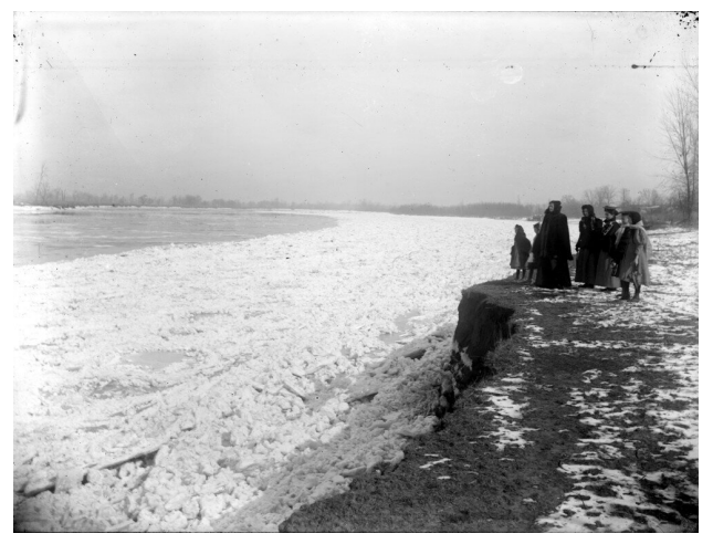
Looking at the frozen/snow-covered Wabash River in New Harmony, Indiana, at unknown date.