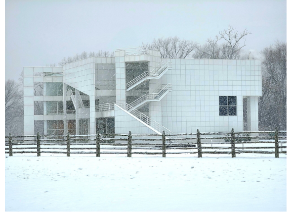
The Atheneum Visitors Center in the winter.