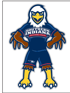
Never re-size any element of any Archie mark