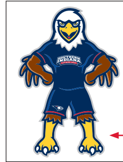
Never use any Archie mark without the copyright symbol