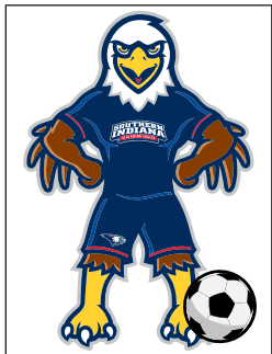
Never add props to any Archie mark