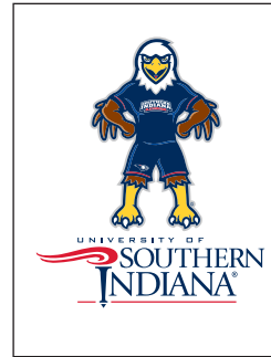
Never combine any Archie mark with a logo.