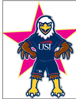
Never combine any Archie mark with other graphic elements