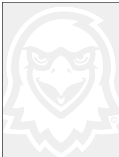
Never use an all white Archie mark on a background color that does not offer sufficient contrast.