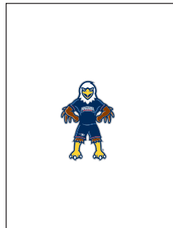
Never use any Archie mark in a size that makes Southern Indiana illegible