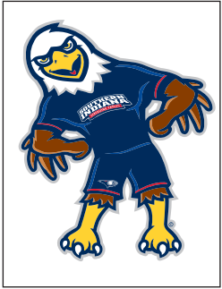
Never alter any Archie mark pose