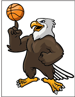
Never use any other eagles to represent or in place of any Archie mark