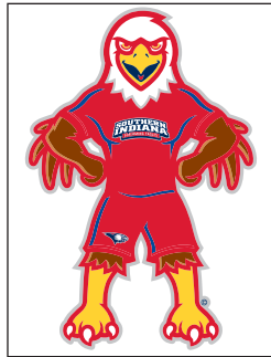
Never change the color of any Archie mark