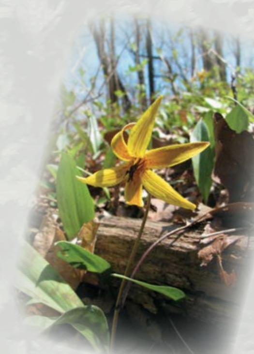
Trout Lily ( Erythronium americanum )