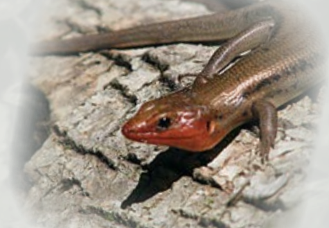
Broad-headed Skink ( Eumeces laticeps )