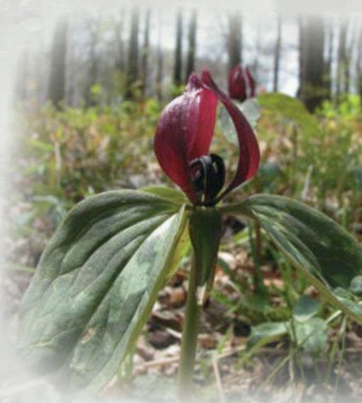
Red Trillium ( Trillium erectum )