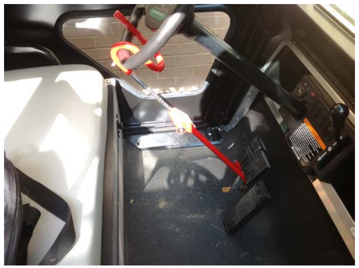
Properly engaged anti-theft brake-steering wheel lock for the golf carts.