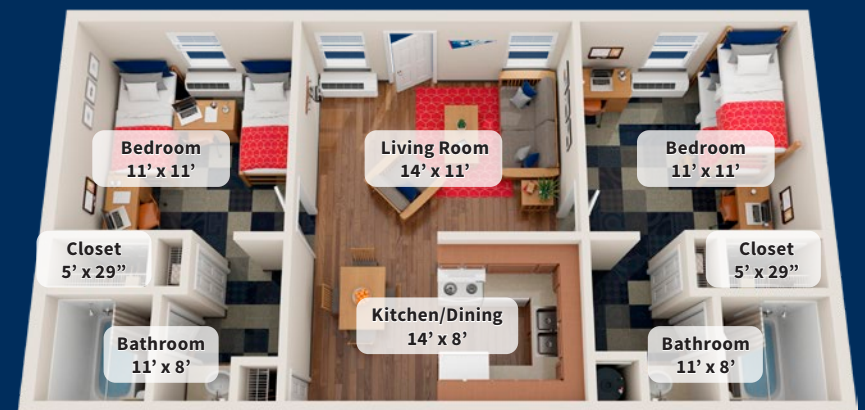
One-bedroom apartment (floor plan not pictured)

living room - 14' x 11' bedroom - 11' x 11' bedroom closet - 5' x 29" bathroom - 11' x 8' kitchen - 14' x 8'