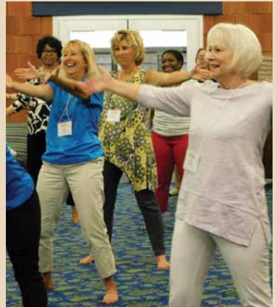
Mid-America Institute on Aging and Wellness exercise class