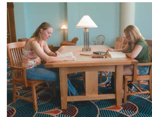
Custom library furniture is crafted of maple.

Furniture in the public areas of the library was manufactured by Jasper Library Furniture, a division of Jasper Seating, in Jasper, Indiana. The custom pieces are crafted of maple. End panels on shelves and other items feature a