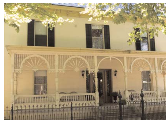
(Above) The recently restored Schnee-Ribeyre-Elliott house is the new home for the staff of Historic New Harmony. Offices are located on the second floor. (Left) The entry hall of the gracious Steamboat Gothic home shows off the reproduction wall and floor coverings. Also decorated in a palette of dark gold, the adjacent north parlor is available as a meeting space for small groups.