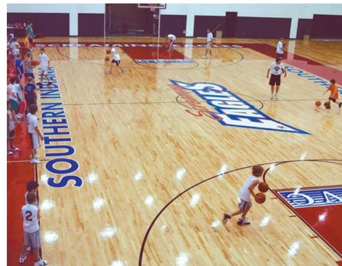
Young players practice their skills on the PAC's new floor during basketball camp.