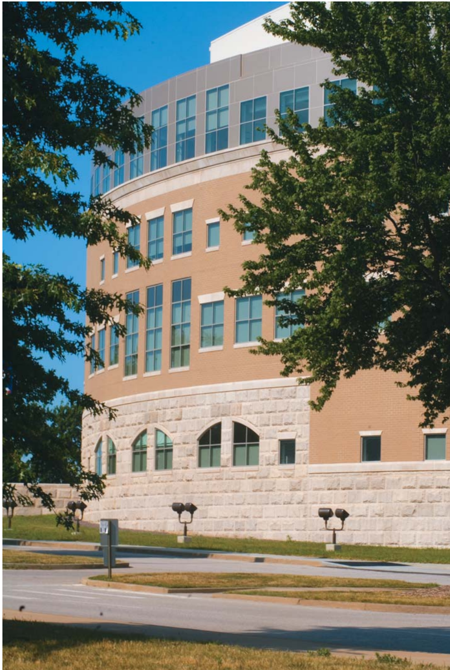
The new David L. Rice Library as seen from University Boulevard

8600 University Boulevard Evansville, IN 47712-3596