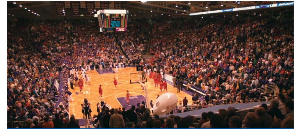
The 2004 Vectren Community Classic at Roberts Stadium was the first meeting in men's basketball for the Screaming Eagles and Purple Aces.