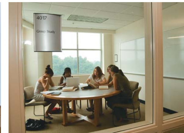
Thirty group-study rooms accommodating from two to 12 persons are available on a first-come, first-served basis.