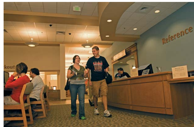
The reference desk on the first floor overlooks computers that library patrons use to access the online catalog and research databases. All library computers offer these functions as well as Internet access and software to create text documents, make spreadsheets, and perform other common tasks.