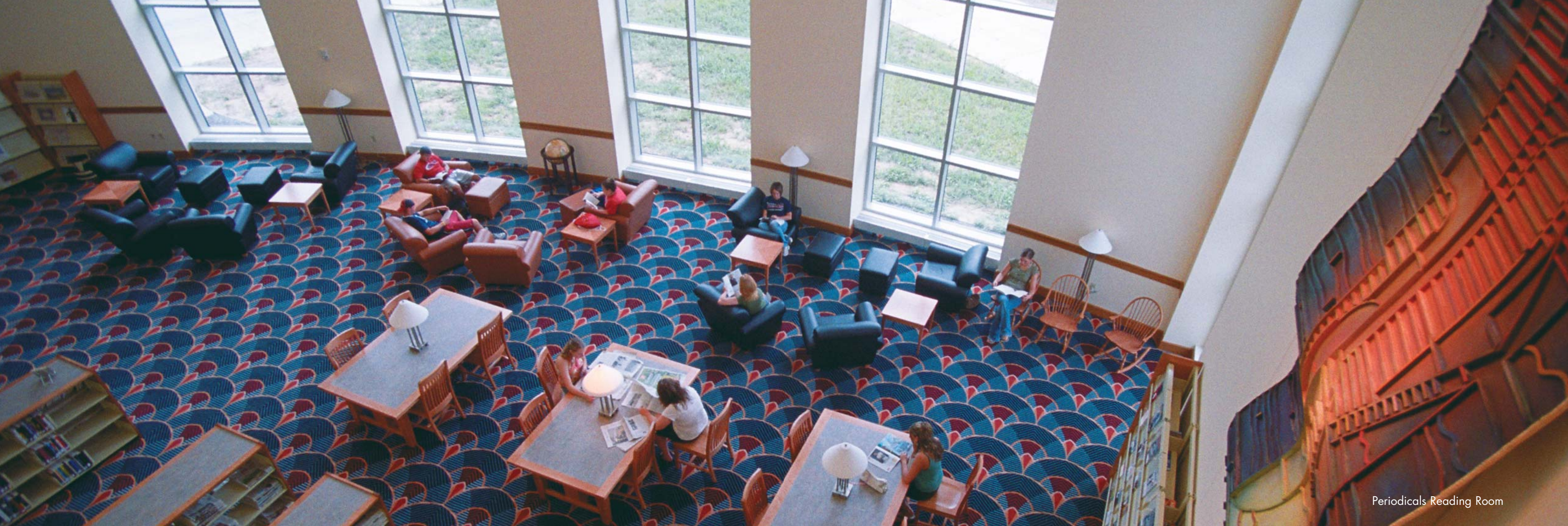
Periodicals Reading Room