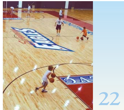
PAC's new look