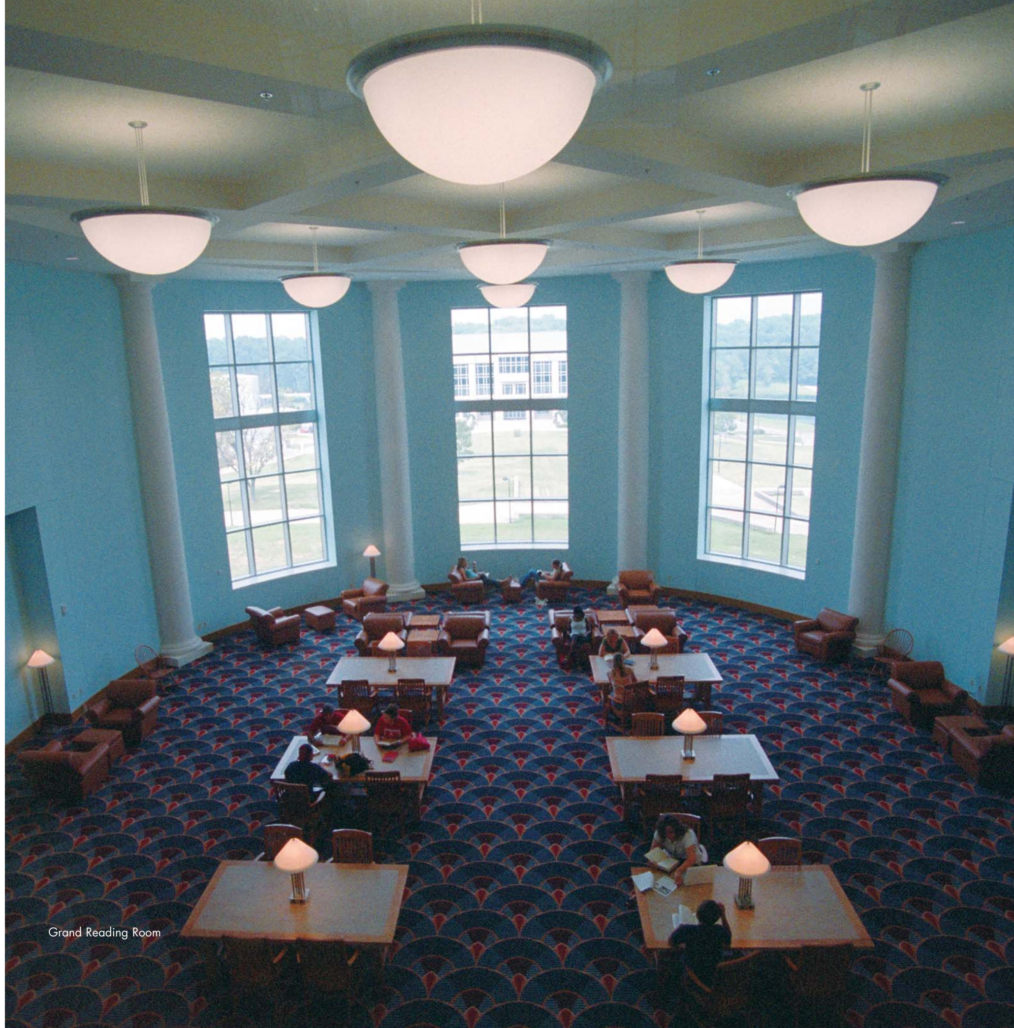
Grand Reading Room

This graphic indicates some of the attributes which focus groups identified as important for the new Rice Library.