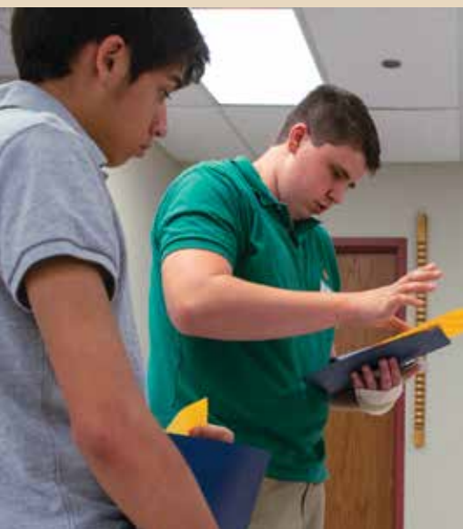
Two high school students examine the charts of fictitious patients at USI symposium on aging.