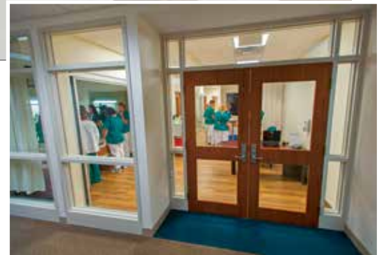
The remodeled Simulation Center, built with a hospital-style design, provides USI Nursing and Health Professions students with an actual healthcare workplace environment in which to learn.

There are three patient beds: two are inpatient-style rooms, and the third is a more open environment for larger simulation groups.