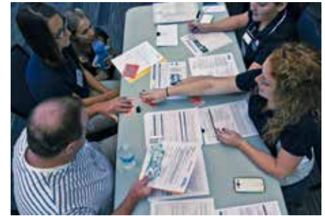
Poverty simulation participants role playing

To help students empathize with their clients, they each took on the persona of a person in poverty or a community employer dealing with employees' dire straits. Booths were set up representing everything from service agencies to pawn shops. A 30-day calendar cycle was broken into four 15-minute segments, each one representing a week. Participants were then assigned a different family structure—such as single father raising three children or a single elderly woman living